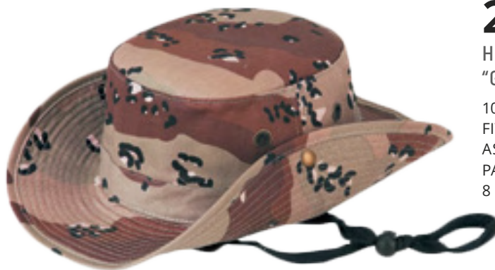
002 DESERT CAMO