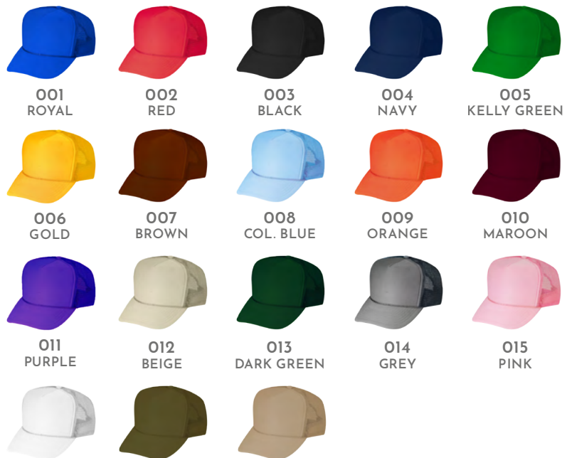
001 ROYAL 002 RED 003 BLACK 004 NAVY 005 KELLY GREEN 006 GOLD 007 BROWN 008 COL. BLUE 009 ORANGE 010 MAROON 011 PURPLE 012 BEIGE 013 DARK GREEN 014 GREY 015 PINK 016 WHITE 021 OLIVE GREEN 022 KHAKI

100% POLYESTER FOAM FRONT W/ MESH BACK 5 PANEL DESIGN PLASTIC ADJUSTABLE SNAP