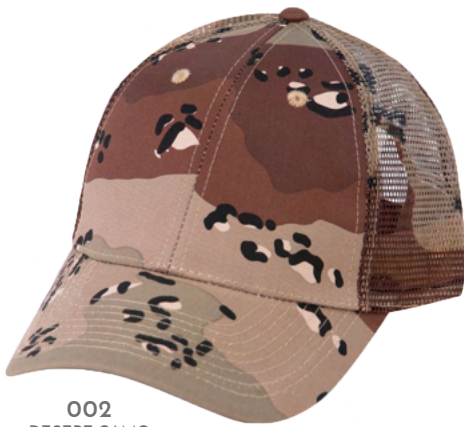
002 DESERT CAMO