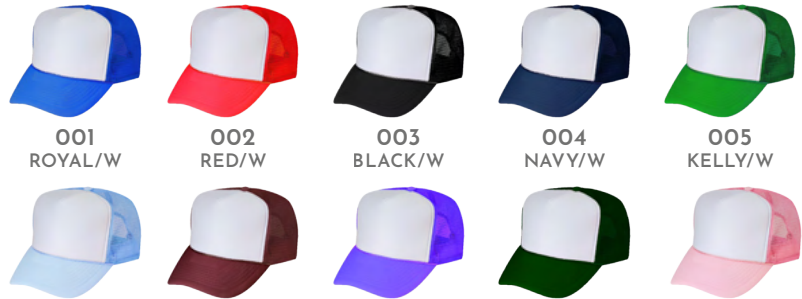
001 ROYAL/W 002 RED/W 003 BLACK/W 004 NAVY/W 005 KELLY/W 008 COL. BLUE/W 010 MAROON/W 011 PURPLE/W 013 DK. GREEN/W 015 PINK/W

100% POLYESTER FOAM FRONT W/ MESH BACK 5 PANEL DESIGN PLASTIC ADJUSTABLE SNAP