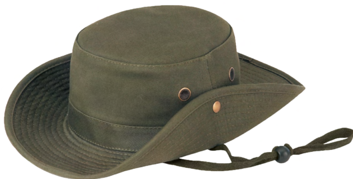
023 OLIVE GREEN