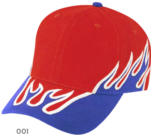
001 RED/WHITE/ ROYAL