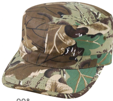
008 OLIVE TREE CAMO