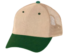
029 DARK GREEN/KHAKE