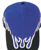
005 ROYAL/WHITE/ BLACK