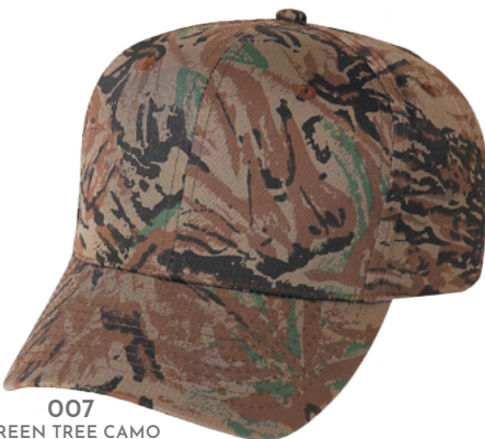
007 GREEN TREE CAMO