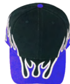
002 BLACK/WHITE/ ROYAL