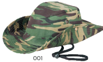
001 GREEN CAMO

ASSORTED DOZEN SIZE 7 1/8 7 1/4 7 3/8 PACKING SCALE: QTY 2 5 5 8 DOZEN/ CARTON