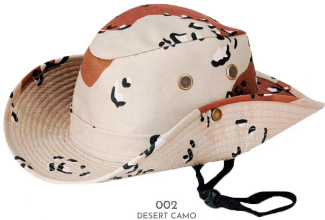
002 DESERT CAMO