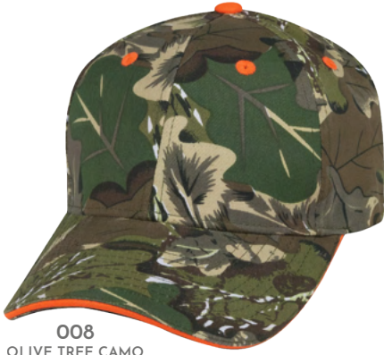
008 OLIVE TREE CAMO