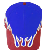
003 ROYAL/WHITE/ RED