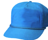
008 COL. BLUE