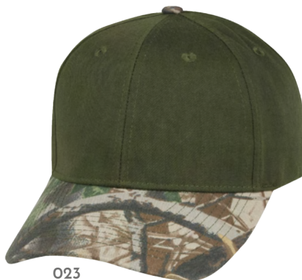
023 OAK CAMO/ OLIVE GREEN