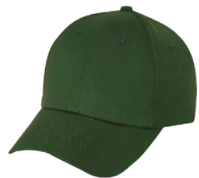
013 DARK GREEN