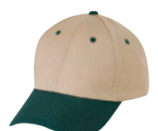
019 DK GREEN/KHAKI