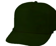
013 DK GREEN