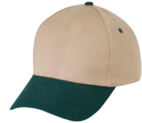
029 DARK GREEN/ KHAKI