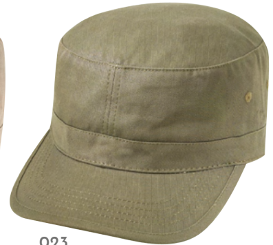
023 OLIVE GREEN

26307 ARMY COTTON CAP 100% COTTON TWILL FABRIC FABRIC STRAP W/HOOK & LOOP CLOSURE