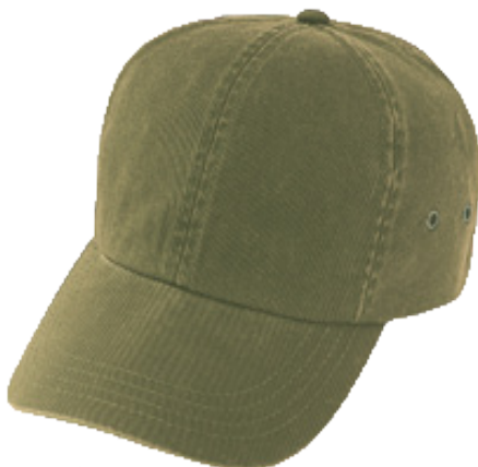
020 OLIVE GREEN