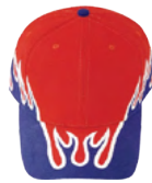
001 RED/WHITE/ ROYAL

100% BRUSHED COTTON TWILL FABRIC 6 PANEL W/FUSED BUCKRAM BACKING SELF FABRIC HOOK & LOOP STRAP