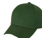
014 DK GREEN