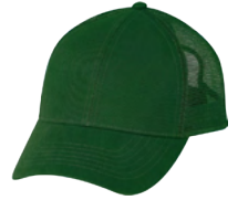
013 DARK GREEN