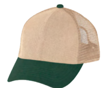
029 DARK GREEN/ KHAKI