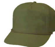
020 OLIVE GREEN