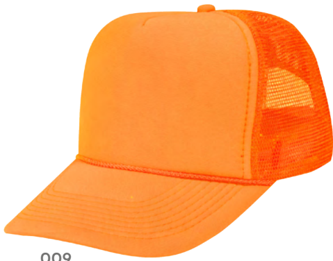
009 NEON ORANGE