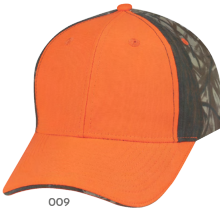
009 FLAME ORANGE/ OAK CAMO