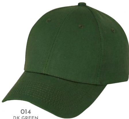
014 DK GREEN

100% HEAVY BRUSHED COTTON TWILL FABRIC 6 PANEL W/FUSED BUCKRAM BACKING SELF FABRIC STRAP W/BRASS BUCKLE & EMBROIDERED EYELETS