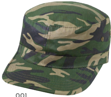
001 GREEN CAMO