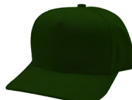
013 DK GREEN