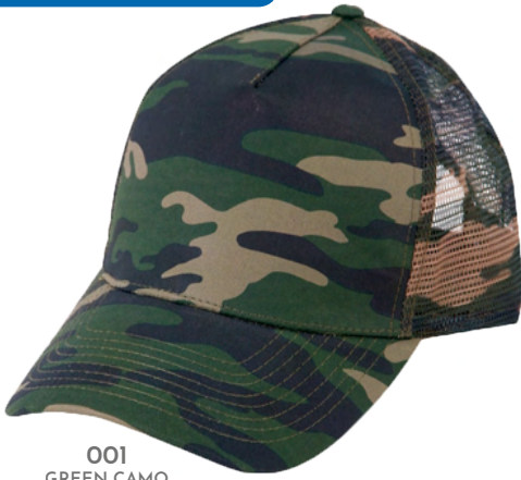
001 GREEN CAMO