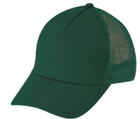
013 DARK GREEN