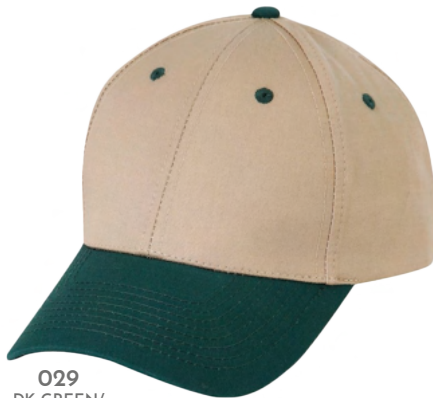
029 DK GREEN/ KHAKI

100% POLYESTER FABRIC 6 PANEL W/FUSED BUCKRAM BACKING SELF FABRIC HOOK & LOOP STRAP