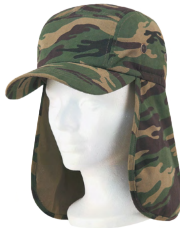
001 GREEN CAMO

EAR FLAP COTTON TWILL 100% COTTON TWILL FABRIC FITTED SIZE