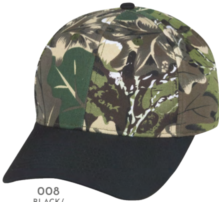
008 BLACK/ OLIVE TREE CAMO