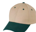
019 DK GREEN/KHAKI