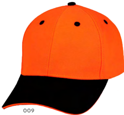
009 BLACK/FLAME ORANGE

PRO STYLE COTTON TWILL WASHED VISOR 100% COTTON TWILL FABRIC CONTRAST STITCHING SELF FABRIC HOOK & LOOP STRAP