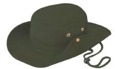
023 OLIVE GREEN