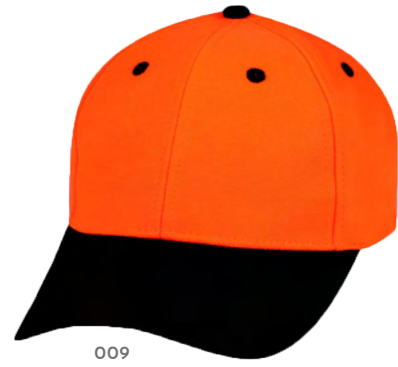
009 BLACK/FLAME ORANGE

FLAME ORANGE CAP W/ BLACK BILL & FLAME ORANGE SANDWICH PREMIUM POLYESTER FLAME ORANGE FABRIC 6 PANEL CONSTRUCTED LOW PROFILE W/ FUSED BUCKRAM BACKING SELF FABRIC HOOK & LOOP STRAP