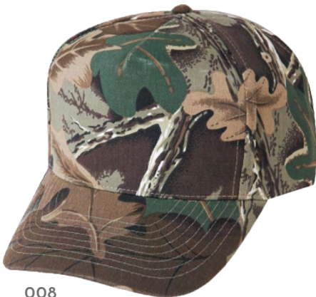
008 OLIVE TREE CAMO