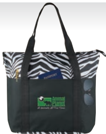
HB163 Zippered zebra 600D poly tote bag 19-1/4"W x 16"H x 6"D