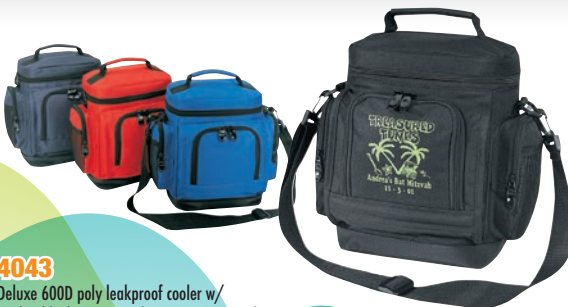
4043 Deluxe 600D poly leakproof cooler w/leather-like bottom, 8-1/2"W x 11"H x 5-3/4"D