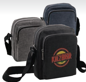
HP1137 Heathered 3 zipper 300D poly sling bag 7"W x 9"H x 4"D