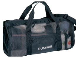
3023 Nylon mesh roll bag 20"W x 10-1/2"Dia.