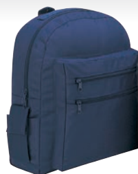
2021 600D poly backpack 12"W x 16"H x 5"D