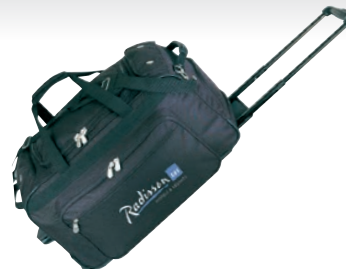
6033 Deluxe 600D poly rolling duffel bag 24"W x 12-1/2"H x 15"D