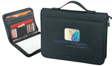
1075 Zippered 600D poly binder padfolio 10"W x 13-3/8"H x 2"D