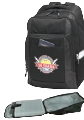
2032 Deluxe 600D poly computer backpack 12"W x 18-1/2"H x 6"D