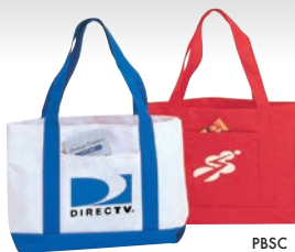
PBPC / PBSC 600D poly tote bag 19"W x 12"H x 4-1/2"D