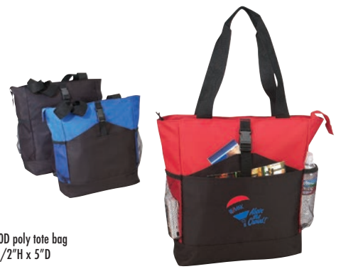
BS207 Zippered 600D poly tote bag 18"W x 15-1/2"H x 5"D