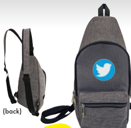
HP2233 new Convertible crossbody backpack 7.5"W x 15"H x 5"D