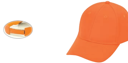
76301 (hook & loop closure) Low crown (constructed) 6 panel flame orange cap