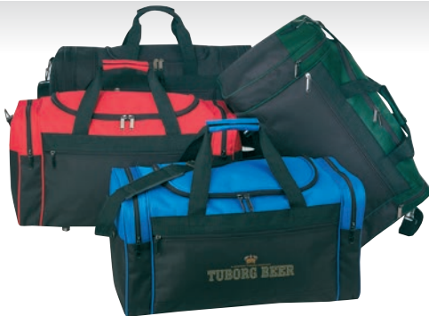
6022 600D poly duffel bag 21"W x 11"H x 9"D