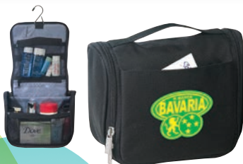
1096 Deluxe 600D poly travel kit 8-1/2"W x 7"H x 4"D