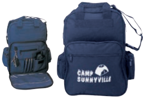
2013 Three-way 600D poly backpack 12"W x 17"H x 5"D