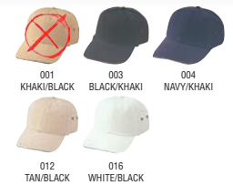
22022 (hook & loop closure) Low crown (unconstructed) 6 panel deluxe polo style cotton twill cap w/sandwich bill Dyed & washed