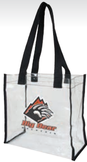
BS238 Clear vinyl tote bag 12"W x 12"H x 6"D