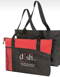
BS214 Zippered 600D poly tote bag 20"W x 14"H x 2-1/4"D