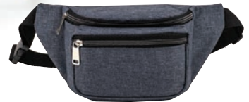
004 Navy heather