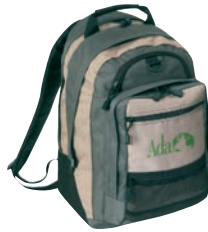
2024 600D poly computer backpack 13"W x 17"H x 8"D