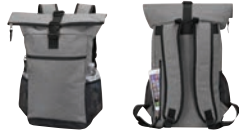
014 Grey heather