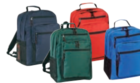
2044 Deluxe 600D poly backpack 12-1/2"W x 16-1/2"H x 8-1/2"D