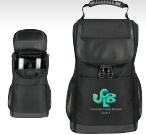
1064 600D poly/600D nylon 2-bottle wine bag w/leather-like bottom, 8-1/2"W x 13"H x 4-1/2"D