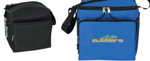
4080 Deluxe 600D poly 24-pack cooler 11"W x 10-1/2"H x 10-1/2"D