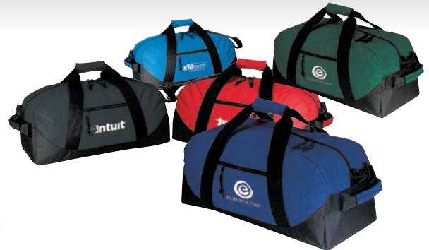
6027 600D poly duffel bag 21"W x 10"H x 10"D