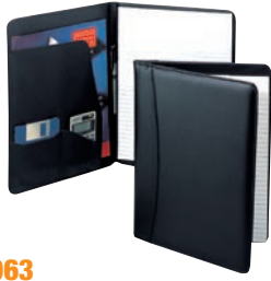
1063 Simulated leather writing folder 9-1/4"W x 12-1/2"H x 1/2"D