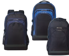
2038 600D poly outdoor computer backpack w/leather-like trim, 13"W x 21"H x 6"D