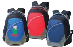
2048 Deluxe 600D poly backpack, easy access outlet for headphones, 15"W x 17"H x 8"D