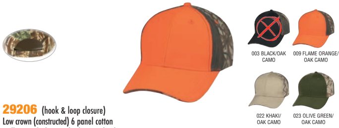
29206 (hook & loop closure) Low crown (constructed) 6 panel cotton twill cap w/oak camo back & sandwich