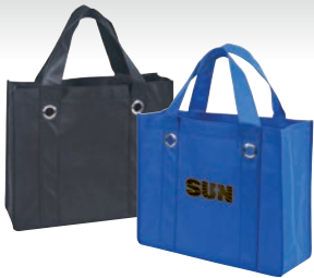
BS118 Eco-Friendly Collections 100gm non-woven polypropylene tote bag w/fabric covered bottom, 13"W x 11"H x 5"D