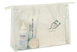
CS1013 Clear vinyl cosmetic tote 8"W x 6-1/2"H x 2-1/4"D