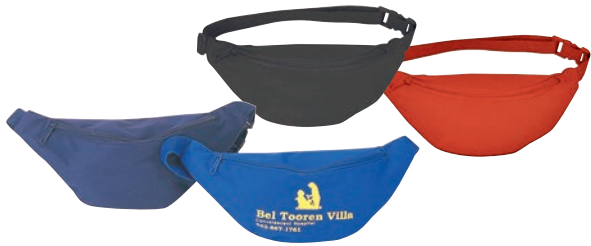
1012 One-zipper 600D poly fanny pack 9"W x 4-1/2"H x 2-1/2"D