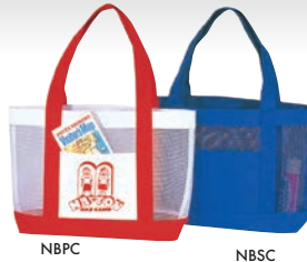
NBPC / NBSC 600D poly mesh tote bag 19"W x 12"H x 4-1/2"D