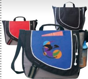
5070 600D poly messenger bag 14"W x 12"H x 3-1/2"D