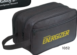
1021 / 1052 600D poly travel kit 1021: 10"W x 6"H x 4"D 1052: 10-1/2"W x 6-1/2"H x 5-1/2"D