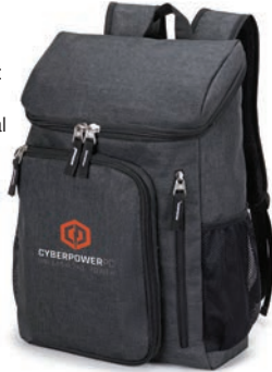
003 Charcoal heather