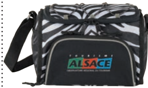
HB4064 Zebra 600D poly 6-pack cooler 9-1/2"W x 6-1/2"H x 6"D