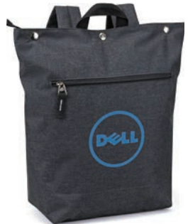
003 Charcoal heather