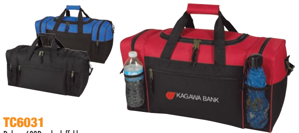
TC6031 Deluxe 600D poly duffel bag 21"W x 11"H x 9"D