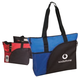
BS204 Deluxe zippered 600D poly tote bag 19"W x 15"H x 3-1/4"D