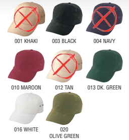
22020 (hook & loop closure) Low crown (unconstructed) 6 panel deluxe polo style cotton twill cap Dyed & washed