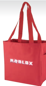
BS234 600D poly tote bag 13-1/2"W x 14"H x 6-1/2"D