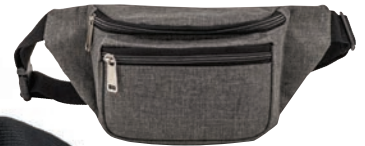
014 Grey heather