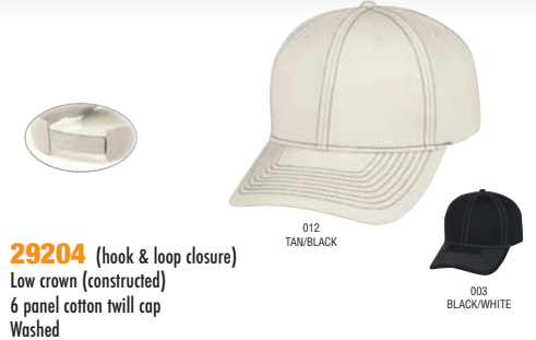
29204 (hook & loop closure) Low crown (constructed) 6 panel cotton twill cap Washed