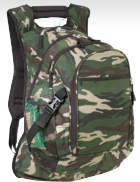
CM2036 600D poly computer backpack, easy access outlet for headphones 15"W x 18-1/2"H x 6"D