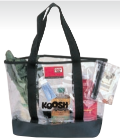
BS139 Clear vinyl tote bag 20"W x 14"H x 6"D