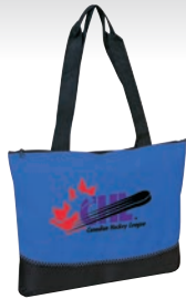
BS212 Zippered 600D poly tote bag 18"W x 13"H x 2-1/2"D