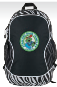
HB2046 Zebra 600D poly backpack 11-1/2"W x 17"H x 7-1/2"D