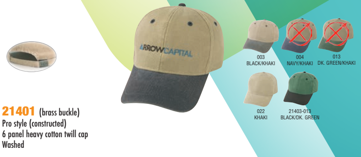
21401 (brass buckle) Pro style (constructed) 6 panel heavy cotton twill cap Washed