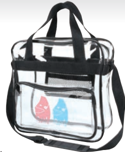
5079 Clear vinyl messenger bag 12"W x 12"H x 5"D