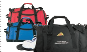
6044 600D poly duffel bag w/shoe storage 21"W x 11"H x 10"D