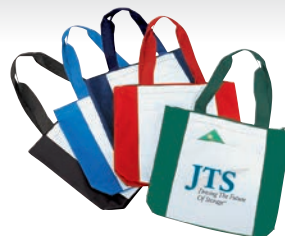
BS185 Zippered 600D poly tote bag 16-1/2"W x 14"H x 4"D