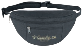
1037 Two-zipper 600D poly fanny pack 12"W x 6-1/2"H x 3-1/4"D