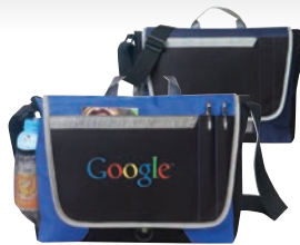
5066 600D poly messenger bag 14"W x 10"H x 3-1/2"D