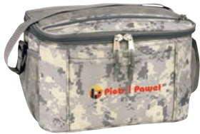
DM4023 Deluxe digital camo 600D poly 12-pack cooler 11-1/2"W x 7"H x 8-1/2"D