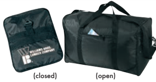
3043 420D nylon foldable duffel bag 20"W x 13"H x 10"D (open) 10"W x 13"H x 1"D (closed)