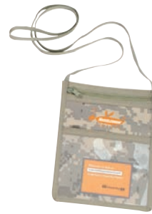
DM700 Digital camo 600D poly badge holder 5-1/4"W x 7"H