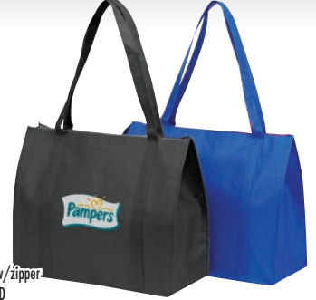
BS114N Eco-Friendly Collections 100gm non-woven polypropylene tote bag w/zipper & fabric covered bottom, 18"W x 15"H x 8"D