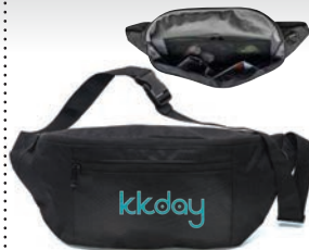
HP1144 600D Poly oversized crossbody fanny pack 20"W x 10"H x 6"D