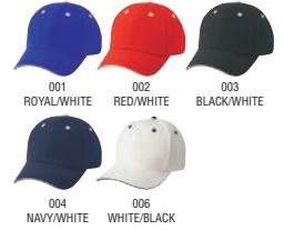
22026 (hook & loop closure) Low crown (constructed) 6 panel 100% polyester wool like cap w/sandwich bill