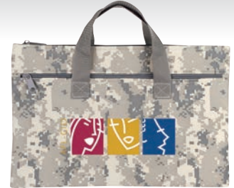
DM5011 Digital camo 600D poly document bag 15-1/2"W x 10"H