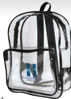
2087 Clear vinyl backpack 12"W x 16"H x 5"D