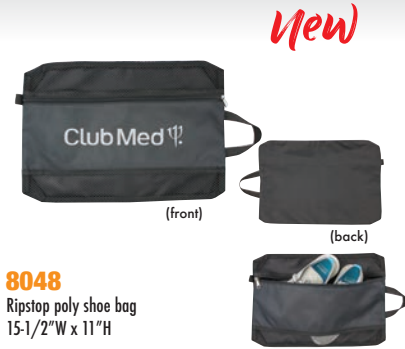
8048 Ripstop poly shoe bag 15-1/2"W x 11"H