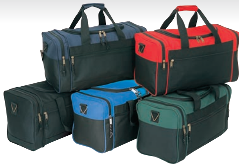
6018 600D poly duffel bag 17"W x 10"H x 9"D