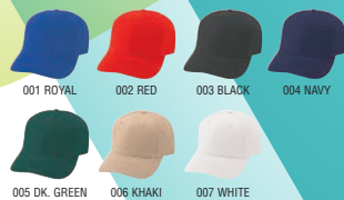
22019 (hook & loop closure) Low crown (unconstructed) 6 panel heavy brushed cotton twill