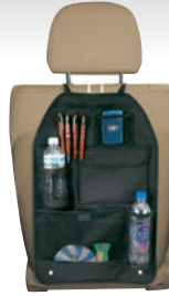
1058 Deluxe 600D poly car organizer 15-1/2"W x 23-3/4"H