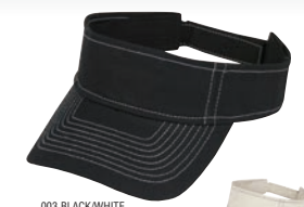
29202 (hook & loop closure) Pro style cotton twill washed visor