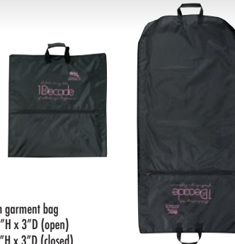
6048 210D nylon garment bag 22"W x 48"H x 3"D (open) 22"W x 24"H x 3"D (closed)