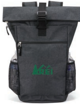
003 Charcoal heather