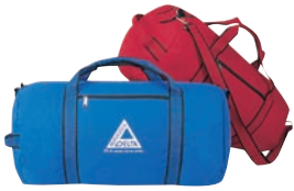
3017 600D poly sport roll bag 22"W x 11"Dia.