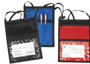
N700 600D poly badge holder 5-1/4"W x 7"H