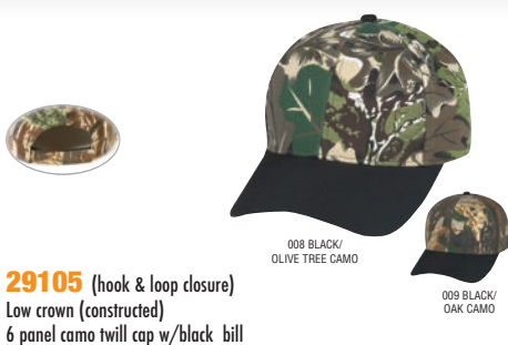
29105 (hook & loop closure) Low crown (constructed) 6 panel camo twill cap w/black bill