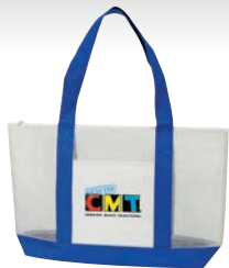
BS216 Zippered 600D poly mesh tote bag 19"W x 12"H x 4-1/2"D