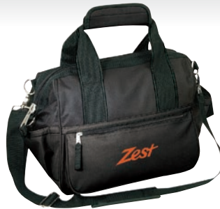
1069 Deluxe 600D poly wide mouth tool bag 16-1/2"W x 13"H x 7"D