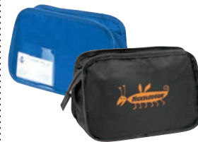
1049 Nylon/PVC make up bag 9-1/2"W x 6-1/2"H x 4-1/2"D