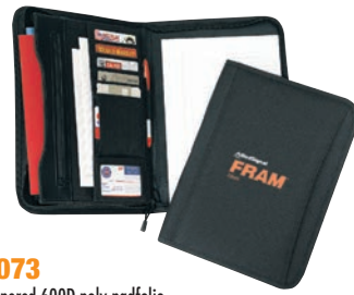
1073 Zippered 600D poly padfolio 10"W x 13-3/8"H x 1-1/4"D