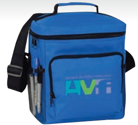
4081 Deluxe 600D poly cooler 9-1/2"W x 11"H x 7"D