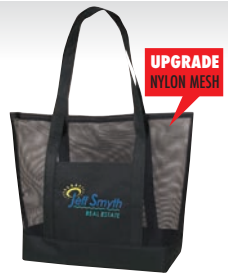
BS159 Deluxe zippered 600D poly double mesh tote bag 20"W x 16"H x 5-1/2"D