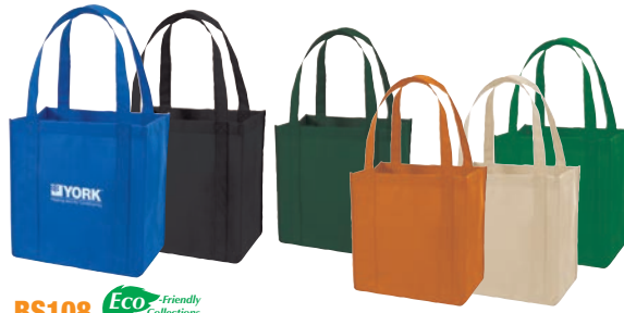
BS108 Eco-Friendly Collections 100gm non-woven polypropylene tote bag w/bottom insert 12-1/4"W x 13-1/4"H x 8"D