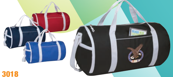
3018 600D poly roll bag 18"W x 10"Dia.