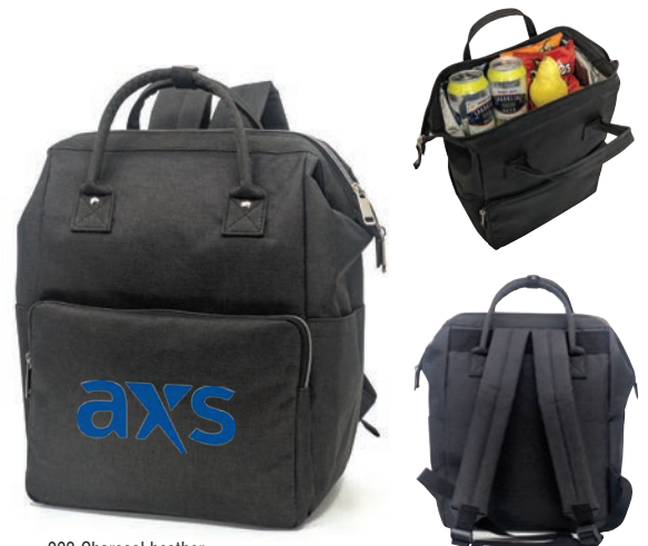
003 Charcoal heather