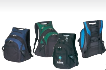
2036 Deluxe 600D poly computer backpack, easy access outlet for headphones 15"W x 18-1/2"H x 6"D