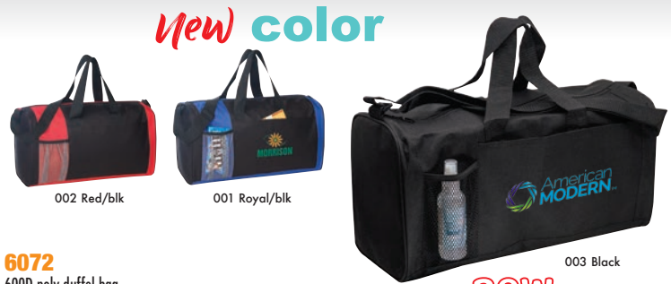
6072 600D poly duffel bag 19"W x 9-1/2"H x 8-1/4"D