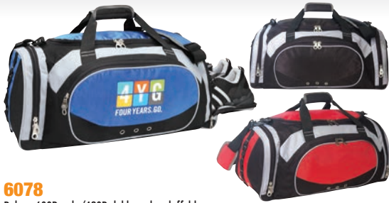
6078 Deluxe 600D poly/420D dobby nylon duffel bag w/shoe storage, 23"W x 11"H x 10"D