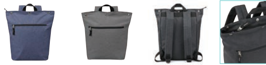
004 Navy heather 014 Grey heather