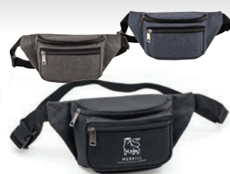
HP1155 Heathered 3 zipper 300D fanny pack 8"W x 5"H x 3"D