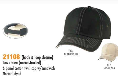
21108 (hook & loop closure) Low crown (unconstructed) 6 panel cotton twill cap w/sandwich Normal dyed