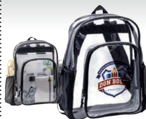
HP2287 new "Super soft" clear vinyl backpack 12-1/2"W x 16-1/2"H x 5"D