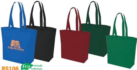
BS106 Eco-Friendly Collections 100gm non-woven polypropylene tote bag, 18-3/4"W x 15"H x 6"D