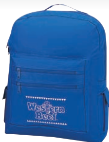
2077 600D poly backpack 12"W x 17-3/4"H x 6"D