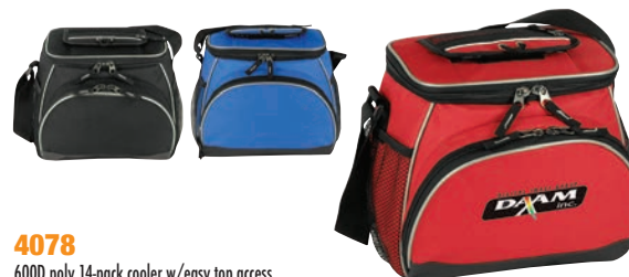
4078 600D poly 14-pack cooler w/easy top access & leather-like bottom, 10-1/2"W x 9"H x 7-1/2"D