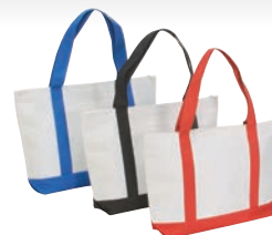
BS217 Zippered 600D poly tote bag 19"W x 12"H x 4-1/2"D