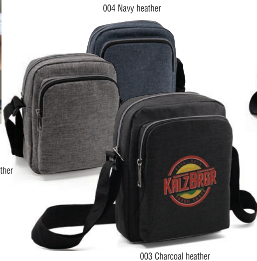
004 Navy heather