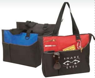
BS209 Zippered 600D poly tote bag 15-1/2"W x 13"H x 4-1/4"D