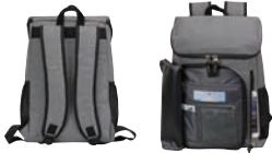
014 Grey heather