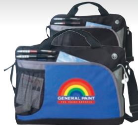
5064 600D poly briefcase 16"W x 12"H x 3"D