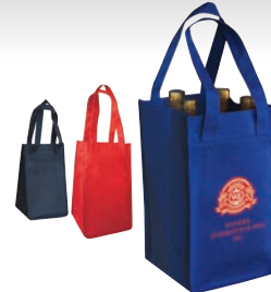
BS230 Eco-Friendly Collections 100gm non-woven polypropylene 4-bottle wine bag, 7"W x 12"H x 7"D