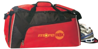
6060 Deluxe 600D poly duffel bag w/shoe storage 23-1/2"W x 11-1/2"H x 11-1/2"D