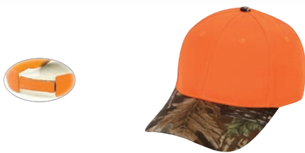
76304 (hook & loop closure) Low crown (constructed) 6 panel flame orange cap w/oak camo bill