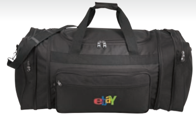
7040 Deluxe 600D poly expandable travel bag 30"W x 14"H x 14"D (open) 27-1/2"W x 14"H x 14"D (closed)