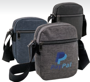
HP1135 Heathered 2 zipper 300D poly sling bag 6"W x 8-1/2"H x 2-1/4"D