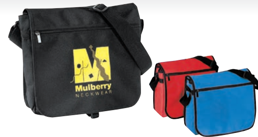
5051 600D poly messenger bag 14"W x 12"H x 4-1/2"D