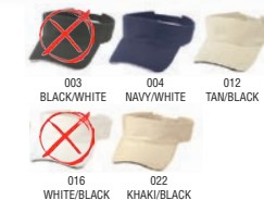
21407 (hook & loop closure) Pro style "deluxe" cotton twill washed visor w/sandwich