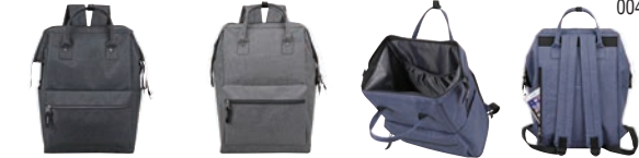
003 Charcoal heather 014 Grey heather