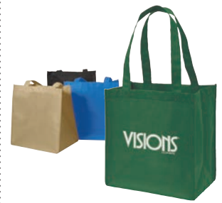
BS109 Eco-Friendly Collections 100gm non-woven polypropylene tote bag 12-1/4"W x 13-1/4"H x 8"D