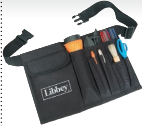
1054 600D poly tool belt 13-3/4"W x 9"H