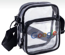
HP1133 new "Super soft" clear vinyl 2 zipper sling bag 6"W x 8"H x 4"D