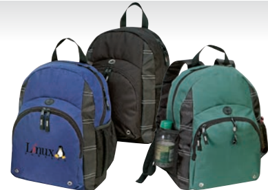
2090 600D poly backpack, easy access outlet for headphones, 11-1/2"W x 16"H x 6"D