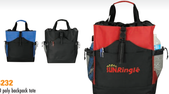
BS232 600D poly backpack tote 13"W x 16-1/4"H x 5-1/2"D