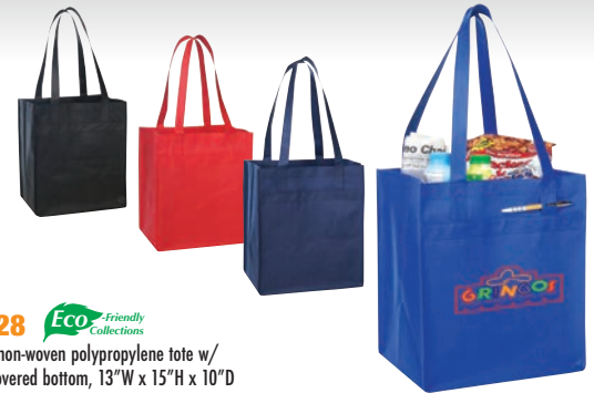
BS228 Eco-Friendly Collections 100gm non-woven polypropylene tote w/fabric covered bottom, 13"W x 15"H x 10"D