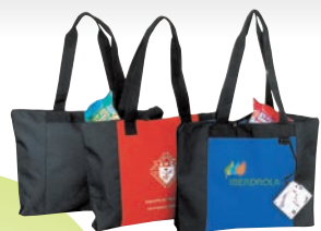
BS149 Zippered 600D poly tote bag 20"W x 15"H x 3"D