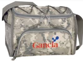
DM4064 Digital camo 600D poly 6-pack cooler 9-1/2"W x 6-1/2"H x 6"D