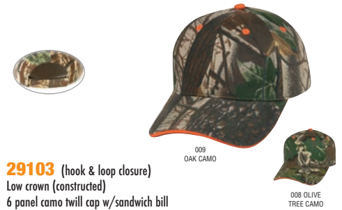
29103 (hook & loop closure) Low crown (constructed) 6 panel camo twill cap w/sandwich bill