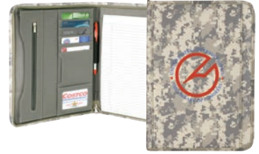
DM1073 Zippered digital camo 600D poly padfolio 10"W x 13-3/8"H x 1-1/4"D