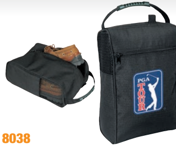
8038 Ripstop poly shoe bag 13-1/2"W x 9"H x 5"D