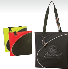
BS215 600D poly tote bag 13-1/2"W x 14"H x 1-1/4"D