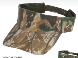
29101 (hook & loop closure) Pro style camo cotton twill visor