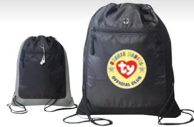
2052 420D poly/sandwich mesh drawstring tote bag 14-1/2"W x 17-1/2"H