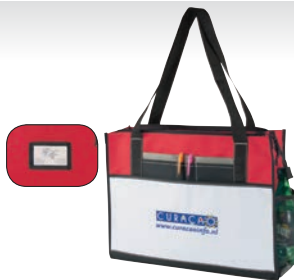
BS236 Zippered 600D poly tote bag 17"W x 13"H x 5"D