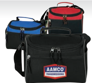
4082 600D poly 6-pack cooler 10"W x 7-3/4"H x 6-1/2"D