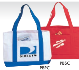
PBPC / PBSC 600D poly tote bag 19"W x 12"H x 4-1/2"D