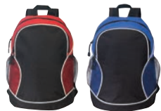
2046 600D poly backpack 11-1/2"W x 17"H x 7-1/2"D