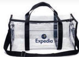
HP6619 new "Super soft" clear vinyl duffel bag 19"W x 9"H x 9"D