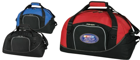
6086 Deluxe 600D poly/600D ripstop nylon duffel bag 19-1/2"W x 12"H x 10"D