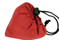
BS221 Foldable 210D poly tote bag 15-1/2"W x 15"H