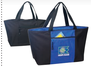
BS218 Zippered 600D poly tote bag 25"W x 12-1/2"H x 7-1/2"D