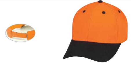
29109 (hook & loop closure) Low crown (constructed) 6 panel flame orange cap w/black bill