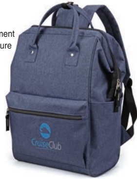
004 Navy heather