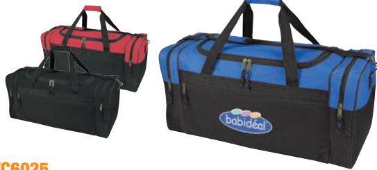
TC6025 Deluxe 600D poly duffel bag 26"W x 12"H x 11"D