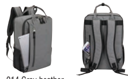
014 Grey heather