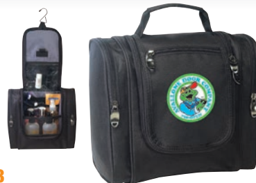
1098 Deluxe 600D poly travel kit 11-1/2"W x 10"H x 5-1/2"D