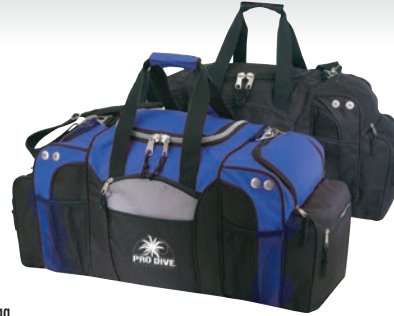
6051 Deluxe 600D poly duffel bag 27-1/2"W x 15"H x 11"D