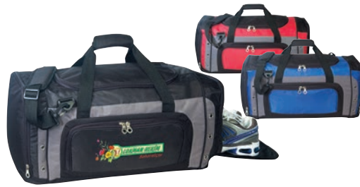
6056 Deluxe 600D poly/420D ripstop nylon duffel bag w/shoe storage 23"W x 12"H x 12"D