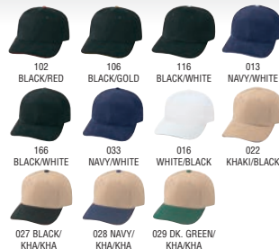
99204 (brass buckle) Low crown (unconstructed) 6 panel heavy brushed cotton twill cap w/sandwich bill