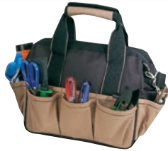
1060 Deluxe 600D poly wide mouth tool bag 12"W x 12"H x 9"D