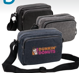
HP1139 Heathered 3 zipper 300D poly sling bag 9"W x 7"H x 4"D