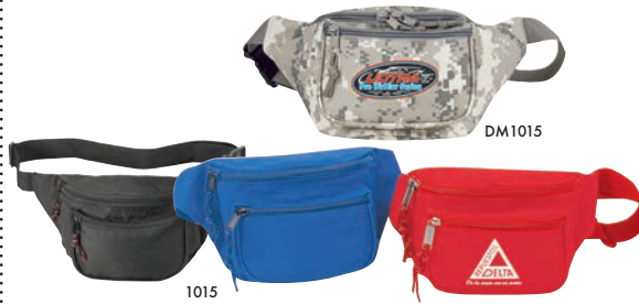
1015 / DM1015 Three-zipper 600D poly fanny pack 8"W x 4"H x 3"D