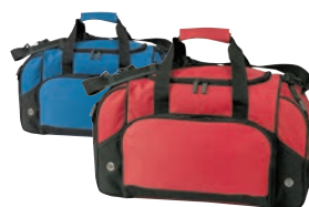
6038 Deluxe 600D poly duffel bag 20"W x 12"H x 9"D