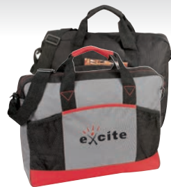
5109 Deluxe 600D poly briefcase 16"W x 13"H x 4"D