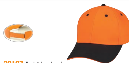
29107 (hook & loop closure) Low crown (constructed) 6 panel flame orange cap w/black bill & flame orange sandwich