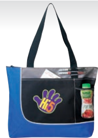
BS224 Zippered 600D poly tote bag 17"W x 14"H x 3-1/2"D