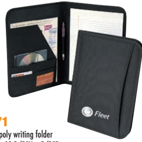
1071 600D poly writing folder 10"W x 13-3/8"H x 5/8"D