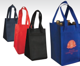
BS230 Eco-Friendly Collections 100gm non-woven polypropylene 4-bottle wine bag, 7"W x 12"H x 7"D