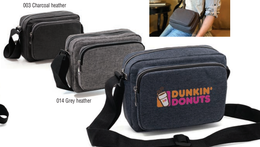
014 Grey heather