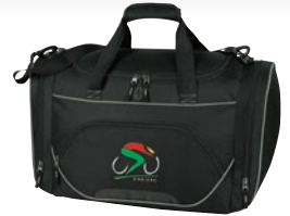
6084 Deluxe 600D poly/420D ripstop nylon duffel bag 22"W x 13"H x 10"D