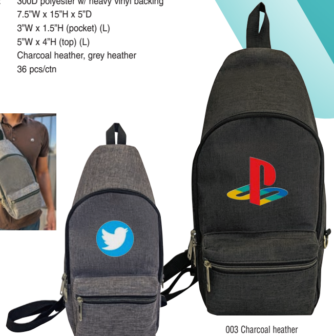
014 Grey heather