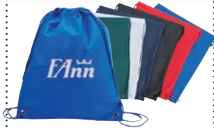
BS130 Eco-Friendly Collections 100gm non-woven polypropylene drawstring tote bag, 15"W x 18-3/4"H