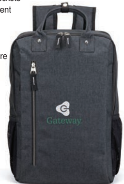
003 Charcoal heather