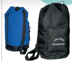
2041 600D poly drawstring backpack 22-1/2"H x 11"Dia.