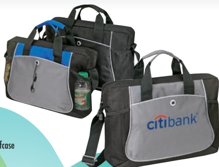
5103 Deluxe 600D poly briefcase 16"W x 12"H x 3"D