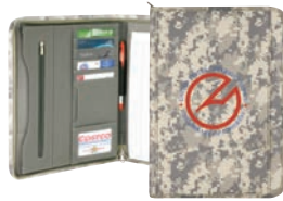
DM1073 Zippered digital camo 600D poly padfolio 10"W x 13-3/8"H x 1-1/4"D