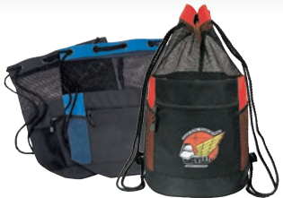
2040 600D poly drawstring mesh backpack 11"W x 20"H x 7-1/2"D