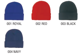
20204 Knitting cap Length: 12"