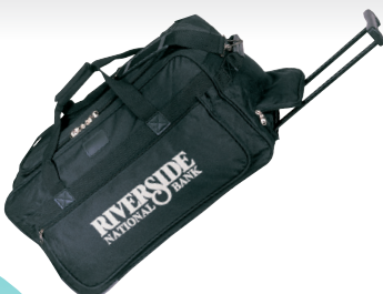
6017 / 6030 600D poly rolling duffel bag 6017: 22"W x 12-1/2"H x 11-1/2"D 6030: 30"W x 14"H x 12"D