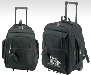
2047 Expandable 600D poly rolling backpack 13-1/2"W x 19"H x 10"D (open) 13-1/2"W x 19"H x 8"D (closed)