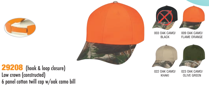
29208 (hook & loop closure) Low crown (constructed) 6 panel cotton twill cap w/oak camo bill