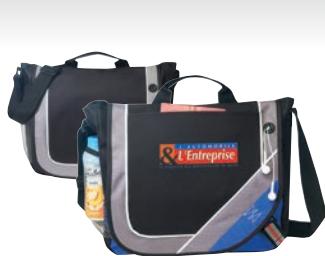
5040 Deluxe 600D poly messenger bag 14"W x 12"H x 3-1/2"D