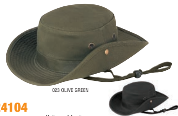
24104 Hunting cotton twill "gambler" bucket hat