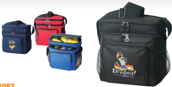
4062 Deluxe 600D poly cooler w/lunch bag 10-1/2"W x 11"H x 6-1/2"D