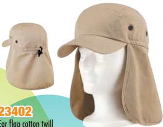
23402 Ear flap cotton twill Fitted size