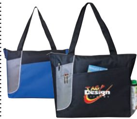
BS208 Zippered 600D poly tote bag 16"W x 13-1/2"H x 3-1/2"D