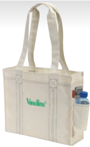
BS219 Deluxe 600D poly tote bag 15"W x 13"H x 5"D