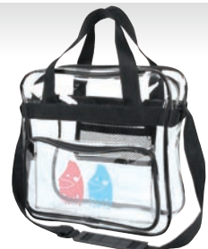
5079 Clear vinyl messenger bag 12"W x 12"H x 5"D