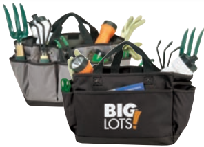
1066 Deluxe 600D poly gardening tote bag 12"W x 9"H x 7-1/2"D