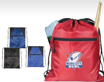
2089 Zippered 210D poly drawstring bag w/2 slip pockets, 15"W x 18"H