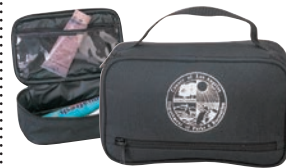
1020 600D poly travel kit 10"W x 6"H x 3"D