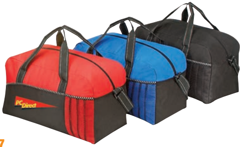
6077 600D poly duffel bag 20"W x 11"H x 10"D