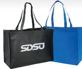
BS112 Eco-Friendly Collections 100gm non-woven polypropylene tote bag 22"W x 16"H x 10"D