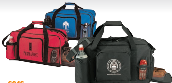
6046 600D poly duffel bag w/shoe storage 20"W x 11"H x 11"D