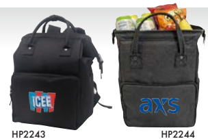
HP2243 / HP2244 new HP2243: 600D poly wide-mouth cooler backpack HP2244: 300D poly heathered wide-mouth cooler backpack, 11"W x 14"H x 8"D