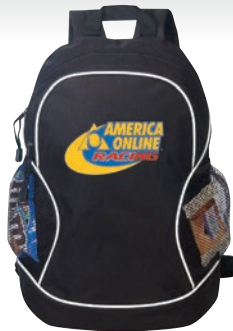
2060 600D poly backpack 12"W x 17"H x 7"D