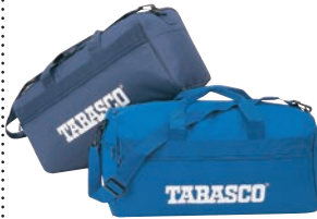
3021 600D poly duffel bag 19"W x 9"H x 9"D