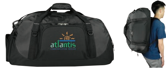
6088 Deluxe 600D poly/420D ripstop nylon piggy bag duffel bag w/shoe storage, 25"W x 13"H x 12"D