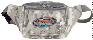
DM1015 Three-zipper digital camo 600D poly fanny pack 8"W x 4"H x 3"D