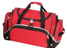
6049 Deluxe 600D poly duffel bag 22"W x 13"H x 10"D