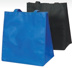
BS110 Eco-Friendly Collections 100gm non-woven polypropylene tote bag 15"W x 16"H x 8"D