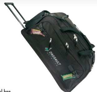
9013 600D poly rolling duffel bag 28"W x 15"H x 18"D