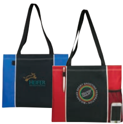
BS200 Deluxe 600D poly tote bag 16"W x 13"H x 2-1/2"D