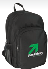
2062 Deluxe 600D poly backpack 12"W x 18"H x 10"D