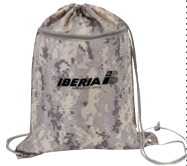
DM151 Digital camo 210D poly drawstring tote bag w/zippered pocket, 15"W x 18-3/4"H