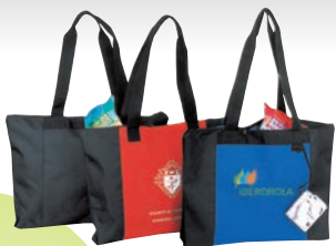
BS149 Zippered 600D poly tote bag 20"W x 15"H x 3"D