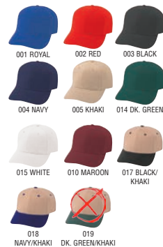
99701 (brass buckle) Low crown (constructed) 6 panel light weight "brushed" cotton twill