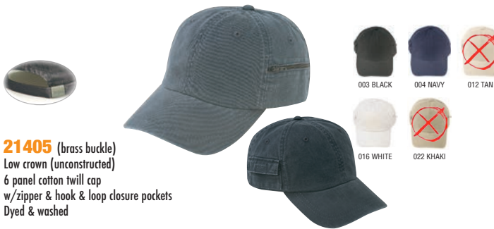
21405 (brass buckle) Low crown (unconstructed) 6 panel cotton twill cap w/zipper & hook & loop closure pockets Dyed & washed