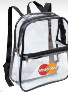
HP2088 Clear vinyl backpack 10"W x 12"H x 4"D