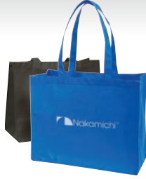
BS111 Eco-Friendly Collections 100gm non-woven polypropylene tote bag 18"W x 15"H x 8"D