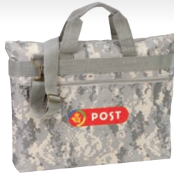
DM5030 Digital camo 600D poly document bag 18"W x 13"H x 2"D