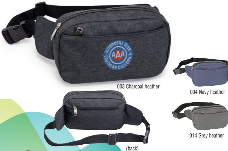
003 Charcoal heather

Material: 300D polyester w/heavy vinyl backing Size: 9"W x 6"H x 2-1/2"D Imprint: 5"W x 3"H (S) Color: Charcoal heather, navy heather, grey heather Packing: 72 pcs/ctn