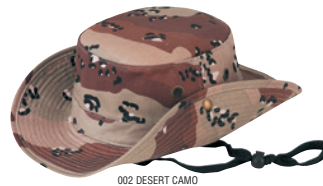
24102 Hunting camo cotton twill "gambler" bucket hat