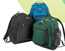
2034 Deluxe 600D poly backpack, easy access outlet for headphones, 13"W x 17"H x 12-1/2"D