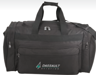
7035 Deluxe 600D poly travel bag 25"W x 14"H x 13"D