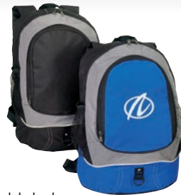
2095 Deluxe 600D poly backpack 12"W x 17"H x 5-1/2"D