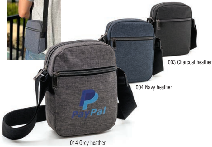
003 Charcoal heather