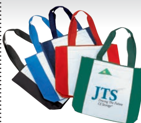
BS185 Zippered 600D poly tote bag 16-1/2"W x 14"H x 4"D