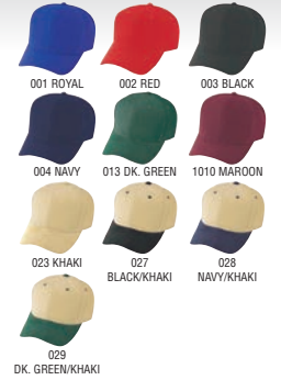
LPWOL (hook & loop closure) 6 panel (constructed) Low crown 100% polyester wool like cap