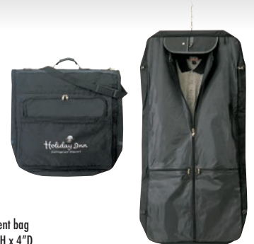
6050 600D garment bag 24"W x 50"H x 4"D