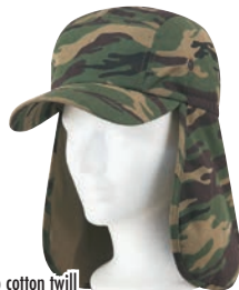
23404 Ear flap camo cotton twill Fitted size