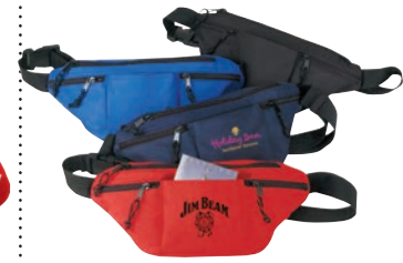
1035 Four-zipper 600D poly fanny pack 14"W x 7"H x 3"D